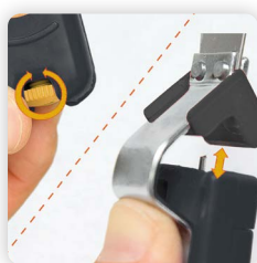
turning out the knife